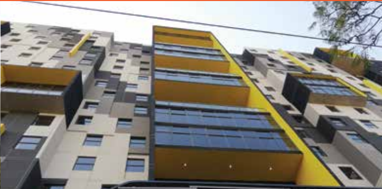
RESIDENTIAL & STUDENT LIVING