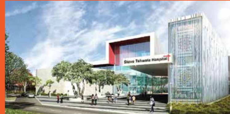
HOSPITALS & MEDICAL