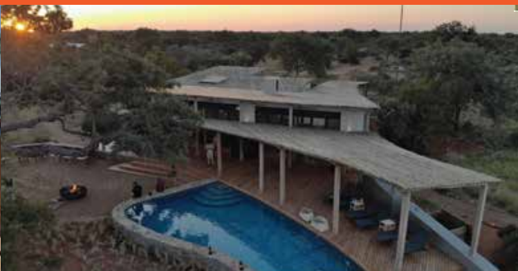
TOURISM & HOSPITALITY