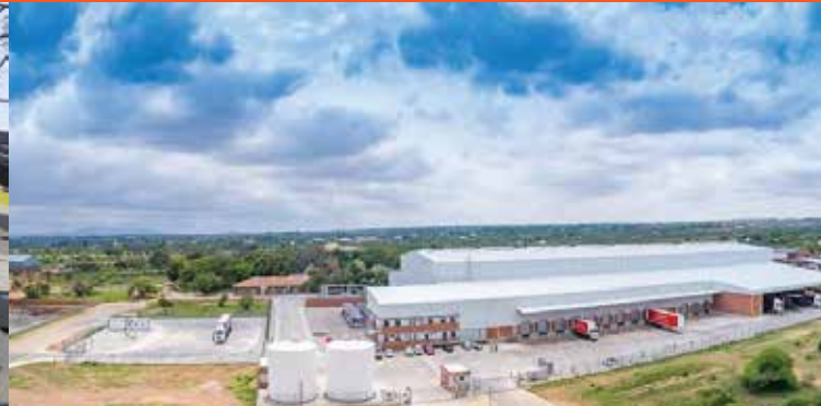
WAREHOUSES & INDUSTRIAL